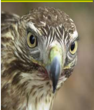
This appears to be juvenile Krider's light morph red-tailed hawk who spends some of his time visiting Bear Branch Trails.

Board of Directors of Bear Branch Trail Association sincerely thanks all our residents for helping keep our greenbelts clean and attractive. Your help reduces our maintenance and replacement costs.